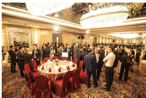
The ballroom was full of guests.