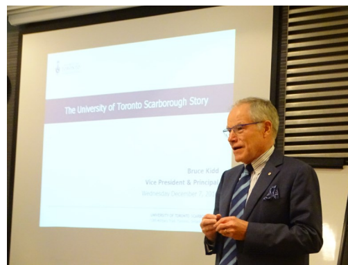
Professor Bruce Kidd, the vice president of University of Toronto and the principal of University of Toronto Scarborough