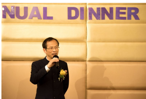
Address by Guest of Honor, The Hon. Tsang Yok-sing, Former President of Legislative Council