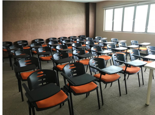
New IPA Office in Malaysia