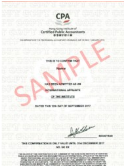
Certificate of International Affiliates Members (IAs) of HKICPA

As part of CMA Australia's dedication in recognizing our member's needs, we will always look for opportunities for our members for better development.