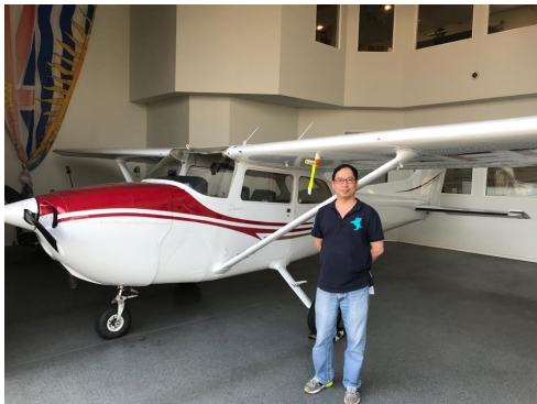
Pacific Rim Aviation Academy in Canada